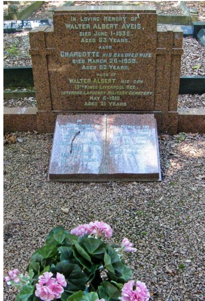
Old Cemetery Downham Market