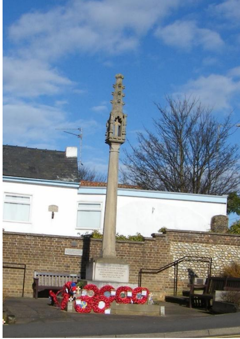
WAR MEMORIAL DOWNHAM MARKET