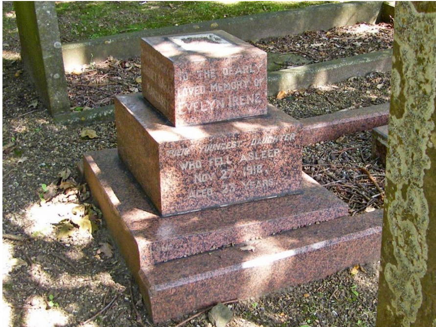
Old cemetery, Downham Market