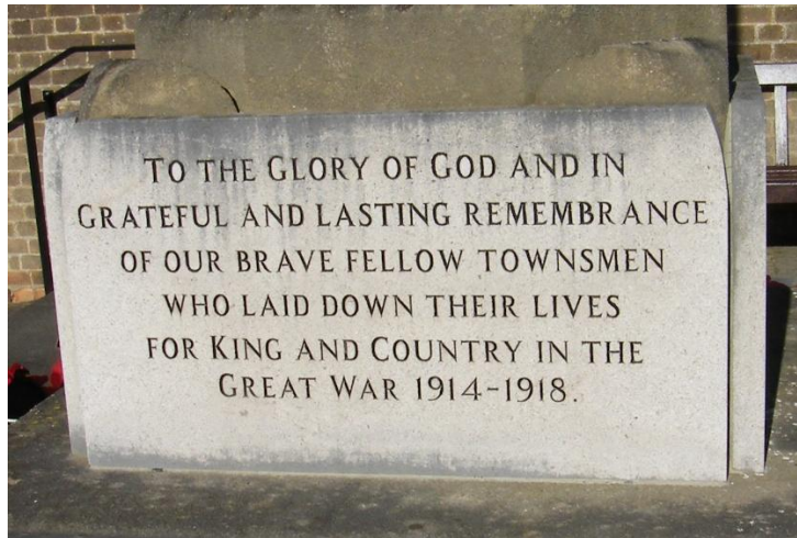
DOWNHAM `S FALLEN HEROES OF THE GREAT WAR