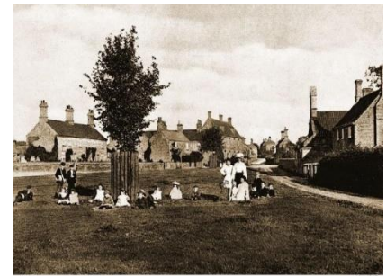
Wimbotsham, The Green

Memorial Seat , around the large lime tree, the seat has memorial plaques naming the people involved in setting up The Fenman Classic Bike Show in 1988. Walk on to the centre of the green and note the high beacon lit on special occasions. The Village Green (a large triangular shape) contains some mature trees planted in early 1900s. Move on to the War Memorial at far end of the green.